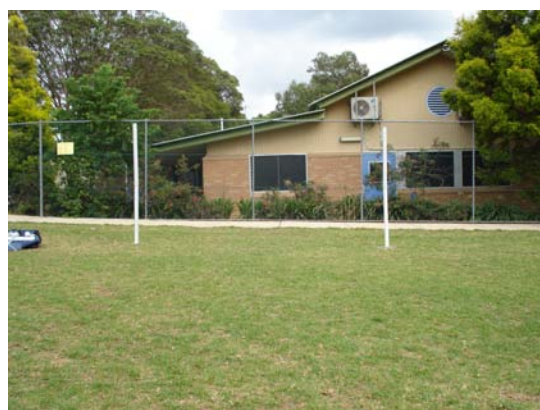
Post Uprights 2.5m Apart