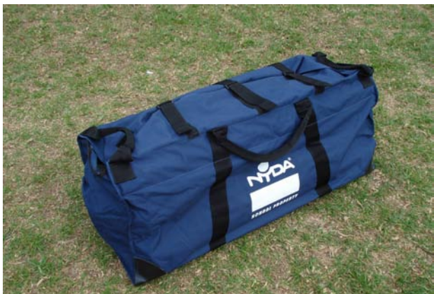
Top Right: Kit component laid out; Right: Heavy spiked bases and PVC tubing; Bottom Left: Carry Bag.

tubing. The tubing makes up the uprights and cross bar. With the cross bar in place, the goals are 1.77m by 2.3m. Due to safety concerns about using cross bars, the kit would be used in our competition without the cross bar and the uprights would be placed 2.5m apart.