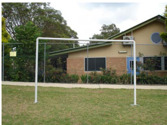
Complete Goal with cross bar

As the zone convenor, I have investigated the availability of various options and consulted with the Sydney East regional convenor Steven Mead. He advised that the best option was the Nyda Portable Soccer/Hockey goal kit sold by Ross Haywood Sports at $260 + $20 freight. This provides a pair of goals made up of heavy spiked metal bases and PVC